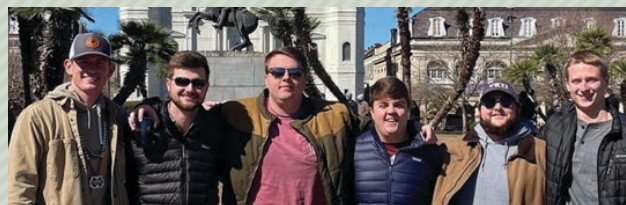
Our brothers enjoying New Orleans during their trip for formal.

Epsilon-Chi Chapter Succeeds in Academics and More